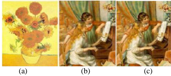
Figure 3. (a) Secrete image (b) Target image (c) Secrete fragment visible mosaic image.

In this mosaic, transforms a secret image into a meaningful mosaic image with the same size and looking like a preselected target image. The transformation process is controlled by a secret key, and only with the key can a person recover the secret image nearly lossless from the mosaic image. A new type of computer art image called secret-fragment visible mosaic image is proposed, which is created by composing small fragments of a given image to become a target image in a mosaic form. These effects hide the images and keep it secret. To create a mosaic image of this type from a given secret color image, the one color scale is transformed into a new color scale, based on which a new image selecting from a database as a target image is the most similar to the given secret image. Secret image is first divided into rectangular shaped fragments, called tile images, which are fitted into a target image.